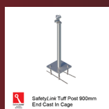
SafetyLink Tuff Post 900mm End Cast In Cage