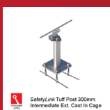
SafetyLink Tuff Post 300mm Intermediate Ext. Cast In Cage