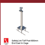
SafetyLink Tuff Post 600mm End Cast In Cage