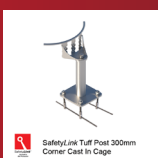
SafetyLink Tuff Post 300mm Corner Cast In Cage