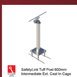
SafetyLink Tuff Post 600mm Intermediate Ext. Cast In Cage