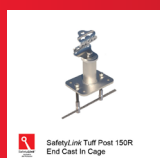
SafetyLink Tuff Post 150R End Cast In Cage