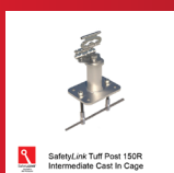
SafetyLink Tuff Post 150R Intermediate Cast In Cage