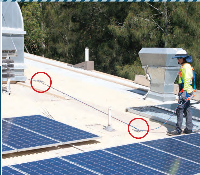
Discrete placement of Roof Anchors